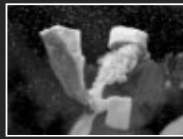
Uh oh... Santa may be lost!