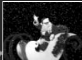
Santa's on his way...