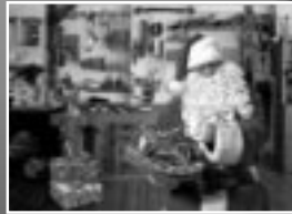
Satellite TV hookup to Santa in his North Pole workshop.

Dates are limited for this one-of-a-kind Christmas program Book early to avoid disappointment.