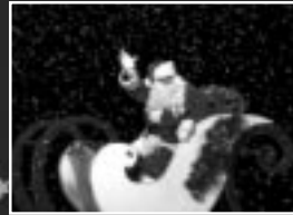
Santa's on his way...