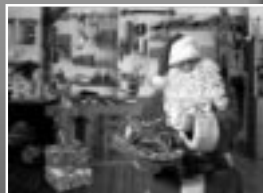
Satellite TV hookup to Santa in his North Pole workshop.

Dates are limited for this one-of-a-kind Christmas program Book early to avoid disappointment.