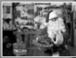
Satellite TV hookup to Santa in his North Pole workshop.

Dates are limited for this one-of-a-kind Christmas program Book early to avoid disappointment.