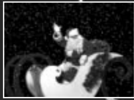
Santa's on his way...