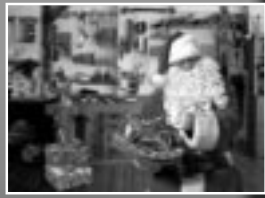
Satellite TV hookup to Santa in his North Pole workshop.

Dates are limited for this one-of-a-kind Christmas program Book early to avoid disappointment.