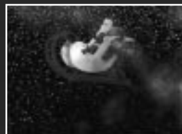
Will Santa survive this fierce snowstorm?