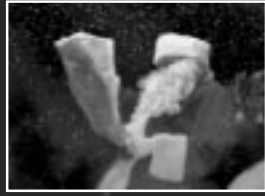
Uh oh... Santa may be lost!