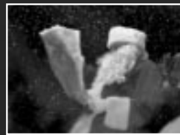
Uh oh... Santa may be lost!