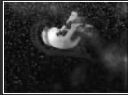
Will Santa survive this fierce snowstorm?