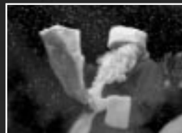
Uh oh... Santa may be lost!