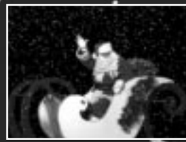
Santa's on his way...