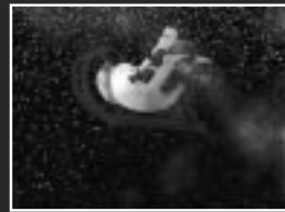
Will Santa survive this fierce snowstorm?