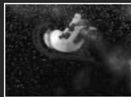
Will Santa survive this fierce snowstorm?